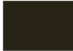
Cool DARK BRONZE