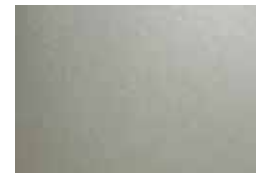
Cool SILVERSMITH 1