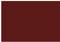
Cool COLONIAL RED