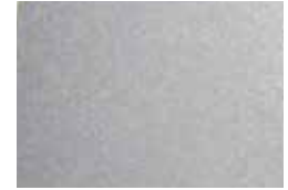
Cool METALLIC SILVER 1

DURA TECH™ mx - Premium Fluoropolymer (PVDF) Pearlescent Coating (Subject to upcharge)