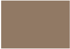
Cool SIERRA TAN