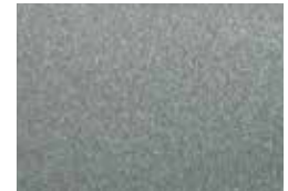
Cool ZACTique® II 1