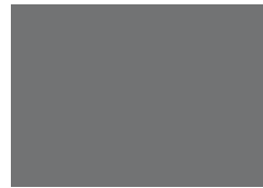
Cool OLD TOWN GRAY