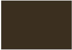
Cool WEATHERED COPPER