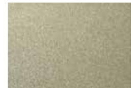
Cool METALLIC CHAMPAGNE 1