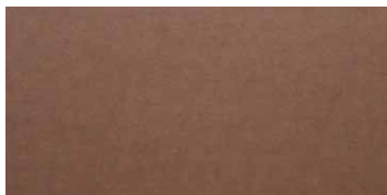
Ironstone SRI: 29 • LRV: 17