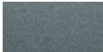
Urban Slate SRI: 24 • LRV: 18