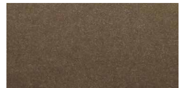
Sungold SRI: 36 • LRV: 15

The Eternal Collection offers four inspiring colors ideal for architectural roofing and siding applications. Mix and match panels with these ageless colors to create a distinct building design.