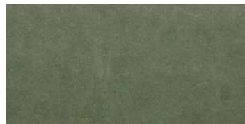
Rainforest SRI: 25 • LRV: 18